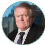
The Hon. Rob Kerin Former South Australian Premier and Board Director, RAI