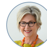
Dr Helen Haines MP Independent Member for Indi