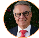
The Hon. Joel Fitzgibbon Former Federal Member for Hunter