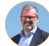
Professor the Hon. John Mcveigh Director Southern Queensland Northern NSW Drought Innovation Hub University of Southern Queensland