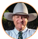
The Hon. Bob Katter MP Member for Kennedy